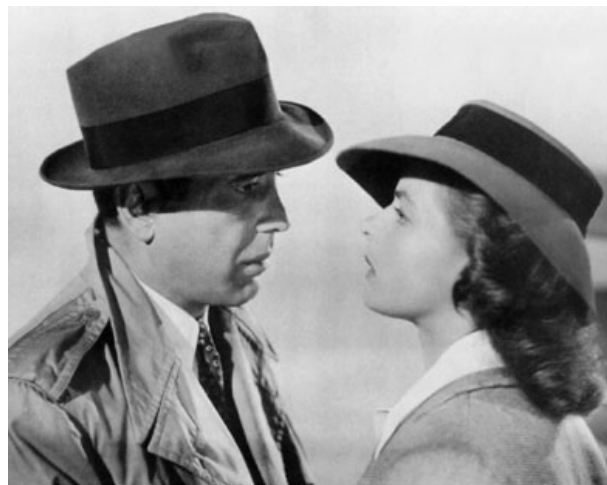
"We'll always have the Writing Center."

Of course not. We care about creating better writers